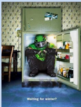
Waiting for winter...