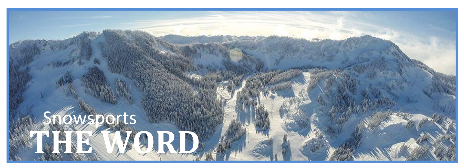
Winter 18-19' | Issue 6 | Nov 9 2018